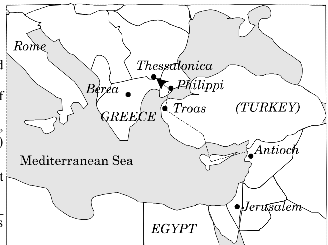
Paul's Second Gospel Journey - Europe!