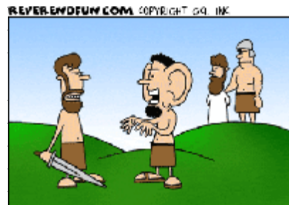
THANKS TO THE ILLUSTRATOR (COW) JOHN 13:37-38 THAT'S RIGHT PETER, WE'RE ARRESTING YOUR PRECIOUS JESUS ... WHAT'R YA GUNNA DO ABOUT IT, HUH? A HAH HAH HAAAAAAAAA